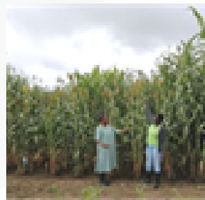
Food and Agriculture