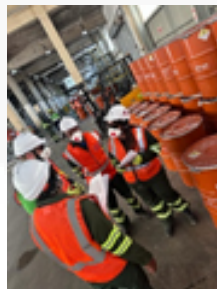
Nuclear Fuel Cycle